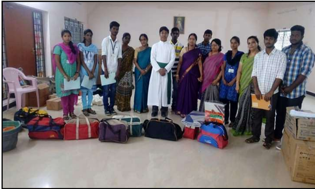
The students with the relief materials distributed by the Management and the free breakfast tokens given by the Alumni Association.