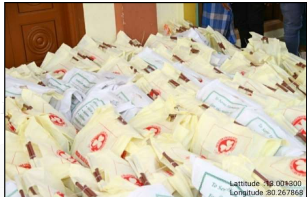
Relief Materials ready to be distributed