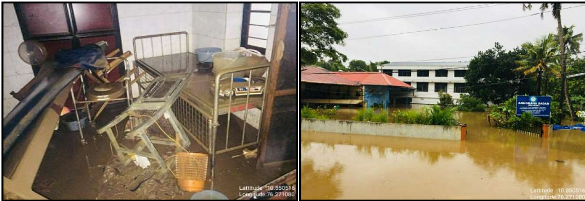
Anu Graha Sadan dorm rooms ravaged by the floods and an overview of Anu Graha Sadan Campus