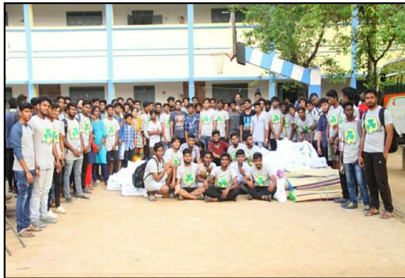
Team of faculty and student volunteers with the Relief Materials