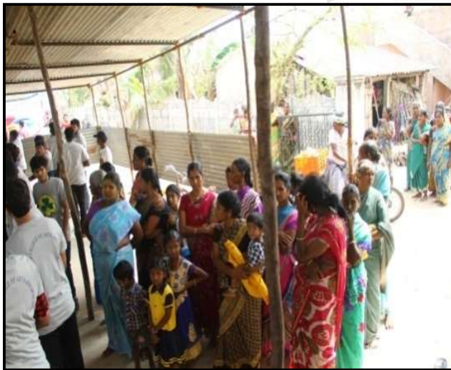
People waiting to receive their relief materials