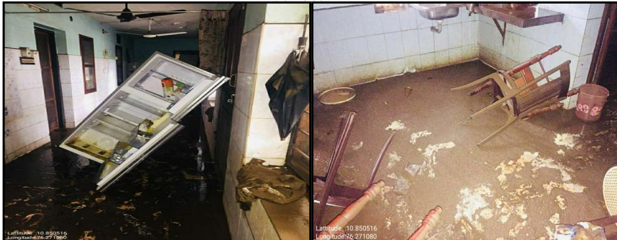
Several lakh worth furniture and belongings were destroyed by the floods at Anu Graha Sadan