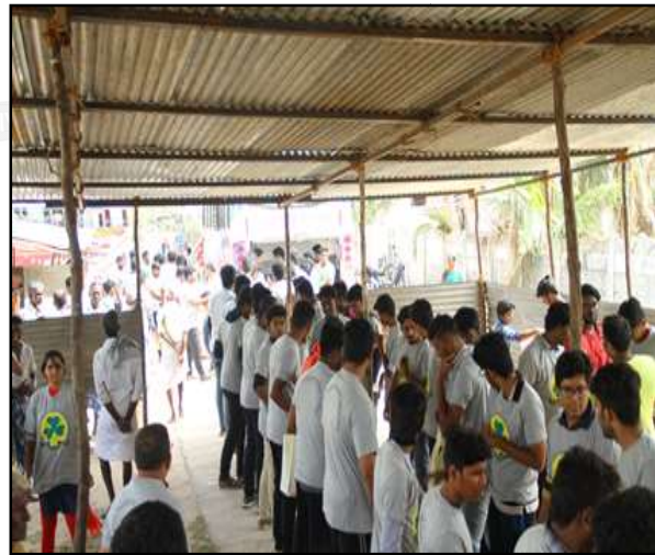
Students Volunteering to load the relief materials